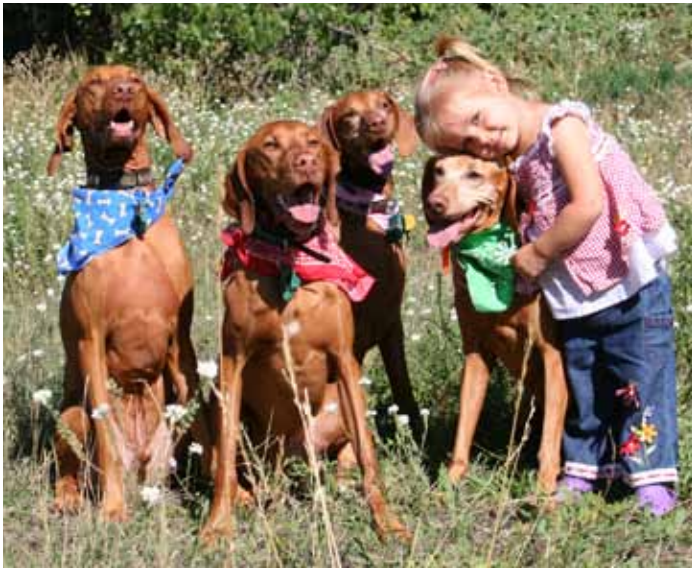
Dublin, Wally, Hailey, Amber, and Mackenzie

fostering; from those families that make the heart wrenching decision to give up their dog when it truly is best for the dog; to those horrible cases of neglect and abuse which lead to aiding some in their journey over the Rainbow Bridge – we will never forget and continue to fight for them; to the volunteers that give so much to help each individual soul; to watching a foster transform before your eyes as you provide love, security, and the basic necessities; to meeting the wonderful adopting families that open their hearts and homes to our precious fosters; to the day when you watch them leave with their new family – so bittersweet; to the day you meet again at a reunion and you are re-energized to do it all again!